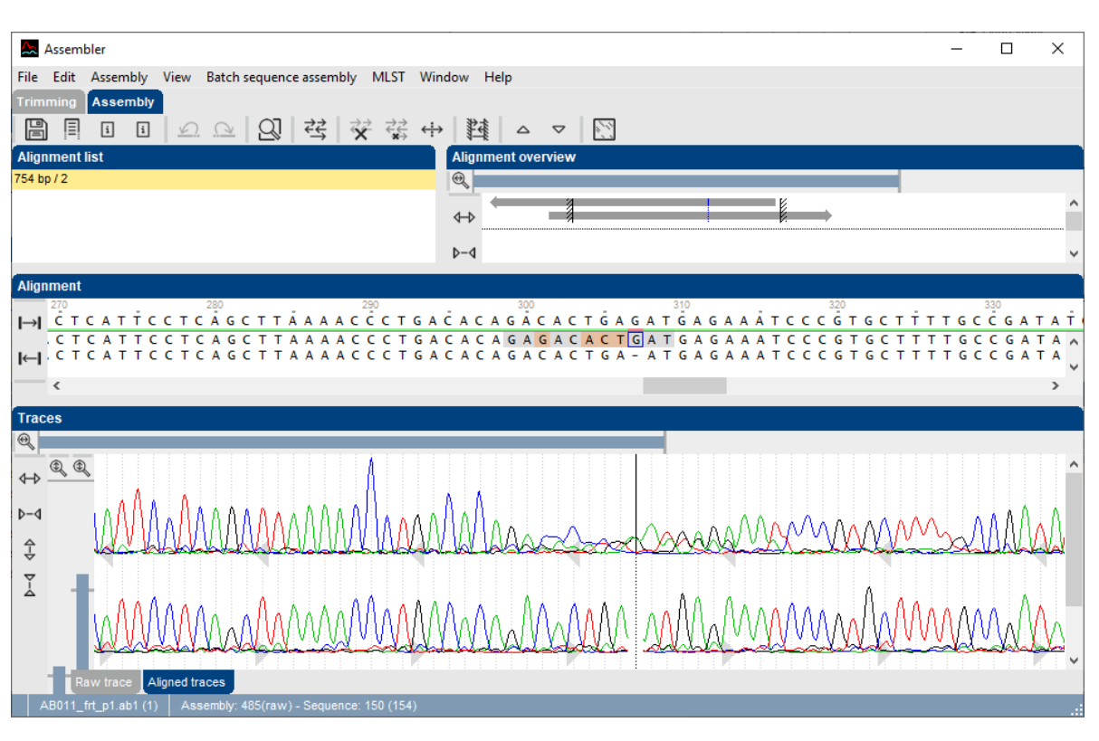
Figure 5: The Contig assembly window.